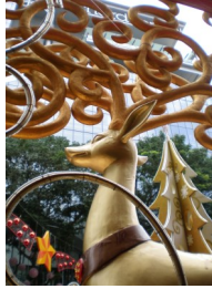
Festive decorations, Singapore

At Elemi, we're fortunate we can work with remote teams and still develop resources to help your students achieve their best. We sincerely hope you have a peaceful and restful break spent in the company of loved ones.