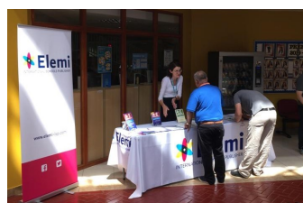
Discussing Elemi resources with teachers at Ibcus event, Dubai, in April